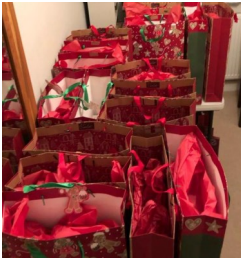
Ready for delivery

Once again, in the run up to Christmas 2023, we gave Christmas gift bags to our nonagenarians. The number of those members who have reached 90 increases year on year; we had 28 eligible members, this time. Only two live outside of the county so 26 gift bags were hand delivered by various members of the Committee. The delivery usually includes a chat with the recipients and a few laughs as we reminisced.